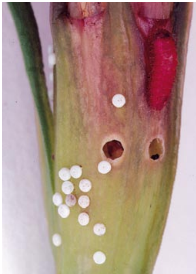
Bud of G. pneumonanthe with eggs, larva and “flight holes” of caterpillars, which left the bud

Populations which live on the comparatively early flowering G. pneumonanthe can cope with this loss in most cases. In contrast this mowing date is a serious threat for populations which live on G. asclepiadea , as it can lead